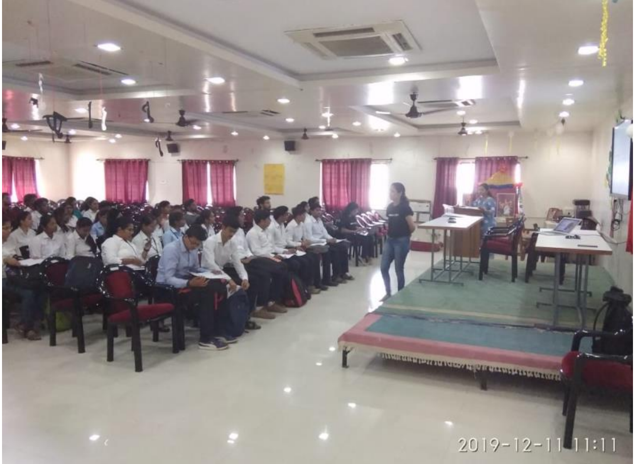
Campus Drive Photos