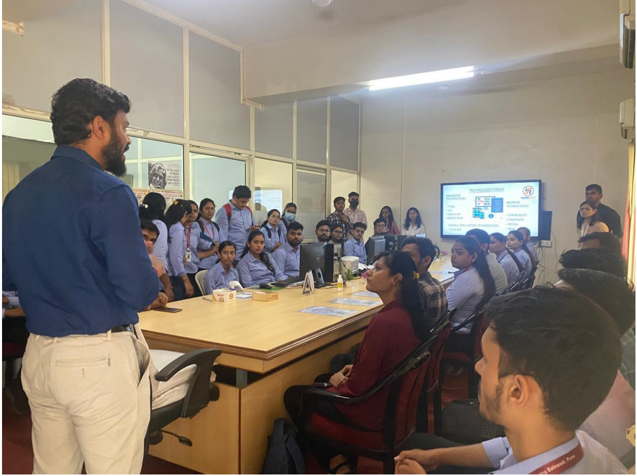
Campus Drive Photos