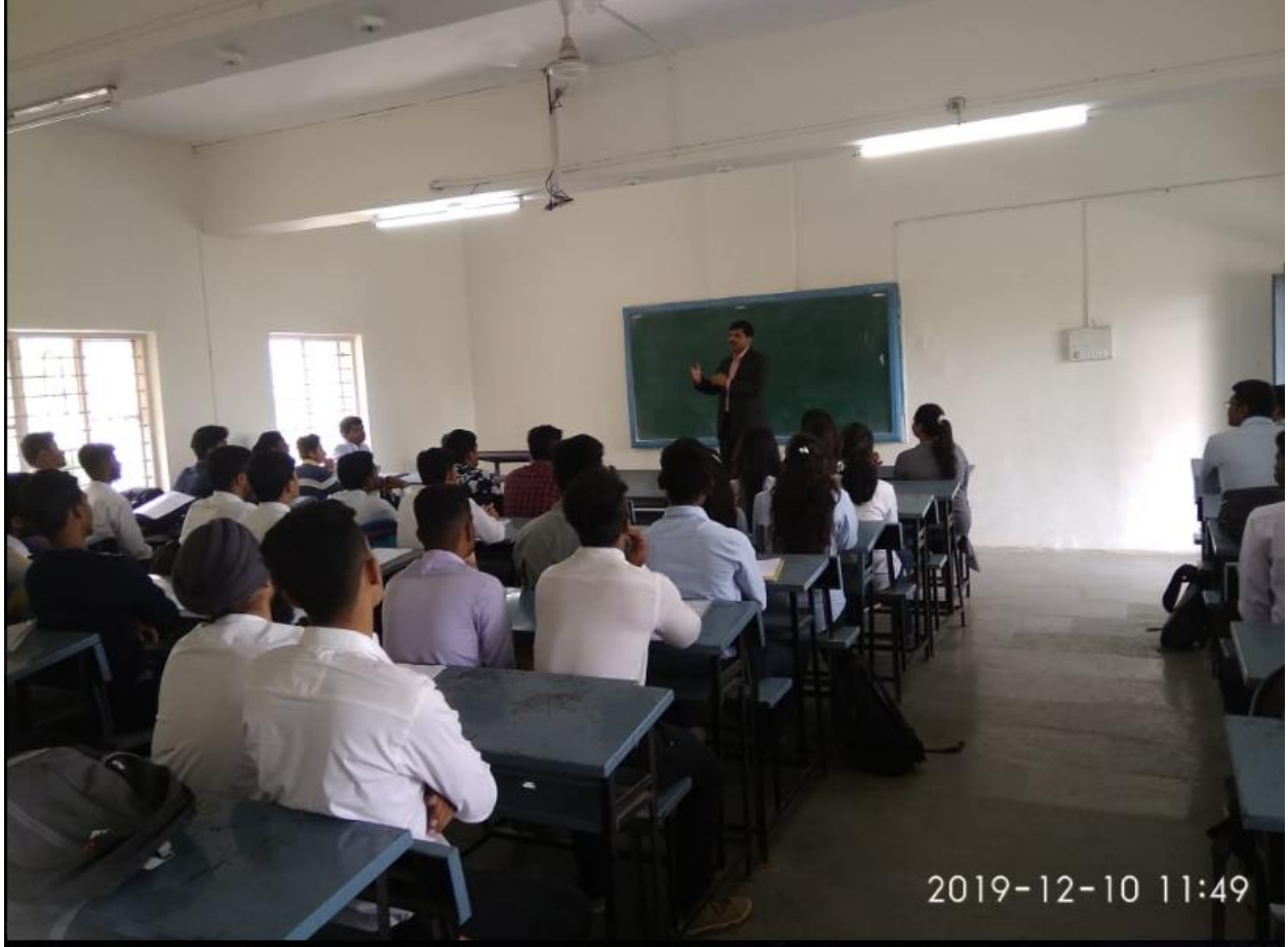
Campus Drive Photos