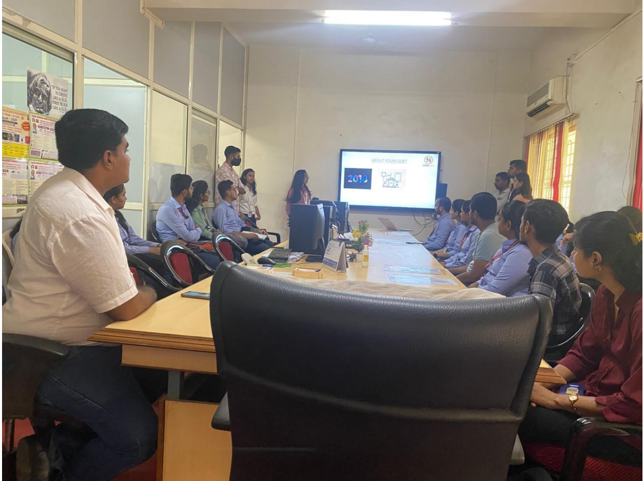
Campus Drive Photos