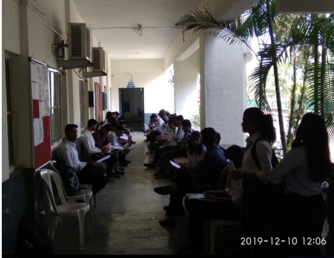
Campus Drive Photos